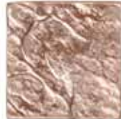
SKU 115 ~ 2x2 Deer Isle Bronze/Natural Luster