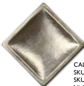
CALDERA Minimal SKU 640 ~ 1.25 inches SKU 641 ~ 2.5 inches Nickel / Natural Luster