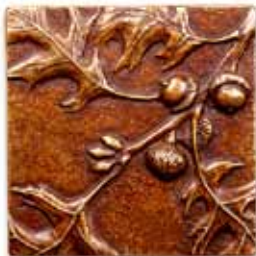
SKU-I02 ~ 4x4 Oak - Bronze/Brown