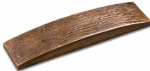
SKU 397 ~ 1.25 x 5 BASKETWEAVE BRONZE BROWN