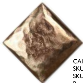
CAIRN Hammered SKU 648 ~ 1.25 inches SKU 649 ~ 2.5 inches Bronze / Natural Luster