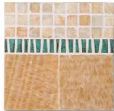
Fragment Mosaic Liner Design Board Bronze / Verdigris