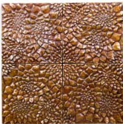
Design Board w/ 4 ~ 6 x 6 tiles