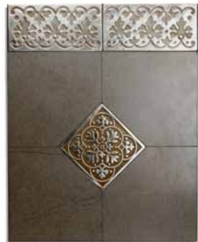
Design Board # 62 ~ Firenze I Nickel / Antique Brown w/ Grey Foussana Honed