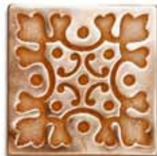
SKU 508 ~ 3x3 Arno * Bronze / Antique Brown