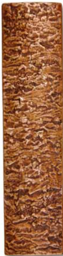
SKU 142 2 x 8 Horizontal Bronze/Brown