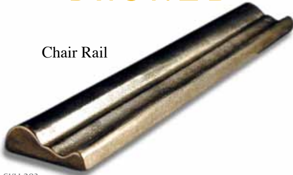
SKU 203 2x12 Chair Rail Nickel/Natural Luster