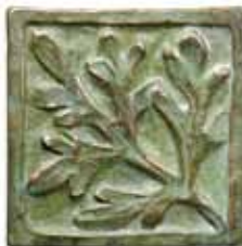
SKU 432 ~ 3x3 Artemisia Bronze/Olive Green