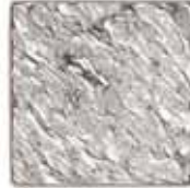
SKU 112 ~ 2x2 Castine Nickel/Natural Luster