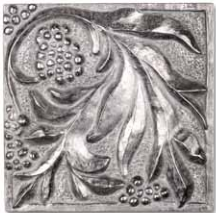
SKU-166 ~ 6x6 Gothic Grapes Nickel/Natural Luster