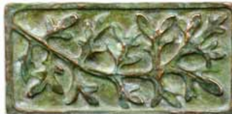
SKU 431 ~ 3x6 Artemisia ~ Bronze/Olive Green