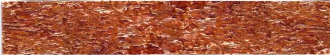
SKU 473 ~ 2 x 12 CASTINE ~ Bronze/Brown

Custom Sizing is available for the Castine Texture. Also stocking a 3x6 Subway.