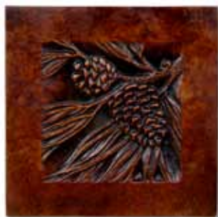
SKU 462 ~ 6x6 Pine Bough - Bronze / Statuary