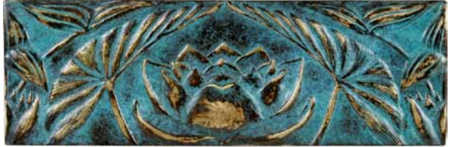
SKU 534 ~ 3 x 9 Lotus Border ~ Bronze/Custom Turquoise