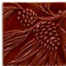
SKU 484 ~ 4x4 Pine Bough - Bronze / Cherry