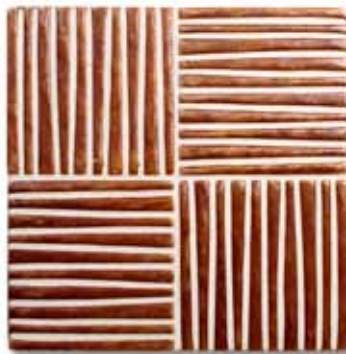
Fragment 4x4 Mini Design Board Bronze / Brown