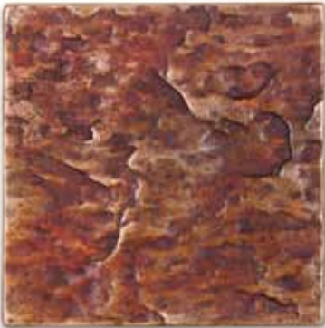
SKU 113 ~ 4x4 Deer Isle Bronze/Brown