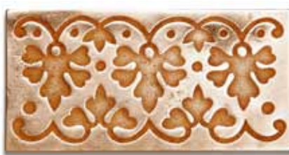
SKU 507 ~ 3x6 Arno Border * Bronze / Antique Brown