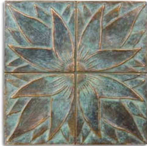
SKU 361 ~ 4x4 Water Lily ~ Broinze Verdigris (Shown in a group of four tiles)