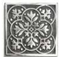
SKU 504 ~ 2.5 Lorenzo Nickel / Antique Black