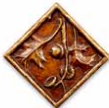
SKU-I20 ~ 3x3 Oak Insert - Bronze/Brown