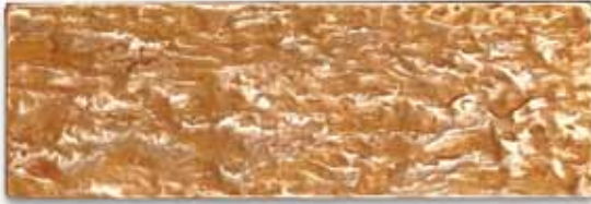
SKU 470 ~ 2x6 CASTINE ~ Bronze/Flemish

Custom Sizing is available for the Castine Texture. Also stocking a 3x6 Subway.