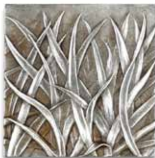
SKU 159 ~ 4x4 Grass Nickel/Atique Brown