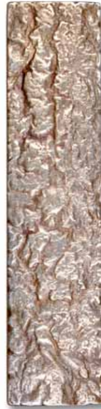
SKU 143 2 x 8 Vertical Nickel/Antique Brown