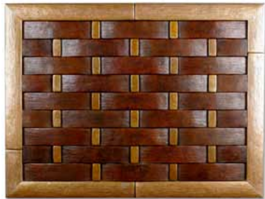
BASKETWEAVE DESIGN BOARD WITH STATUARY WEAVE AND FLEMISH BRICK AND FRAME