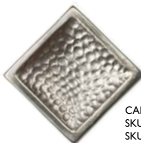
CALDERA Moonscape SKU 642 ~ 1.25 inches SKU 643 ~ 2.5 inches Nickel / Natural Luster