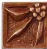
SKU 168.1 ~ 2x2 Gothic Grape Bronze/Red