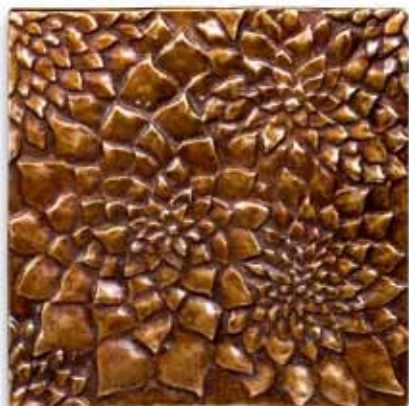
SKU 430 ~ 6 x 6 Hens & Chicks Bronze / Brown Also Available in 4 x 4 (SKU 554)