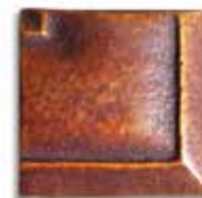
SKU 271 ~ 2x2 Montana Corner Bronze / Brown