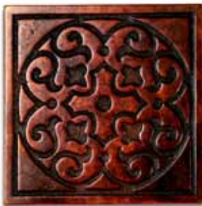
SKU 509 ~ 4x4 Duomo Bronze / Statuary

Inspired by the great Italian city of Florence, birthplace of the Renaissance, the Firenze Collection is a series of sophisticated, low relief "etched" castings with an old-world feel. Solid cast bronze from recycled metal, suitable for use in residential and commercial floor applications. The collection is available in bronze or nickel and all finishes, including a Bronze / Antique Brown unique to this series. *