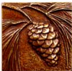
SKU-I01 ~ 4x4 Pine - Bronze/Brown