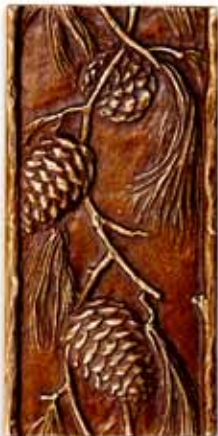
SKU-I07 ~ 3x6 Pine Border - Bronze/Brown