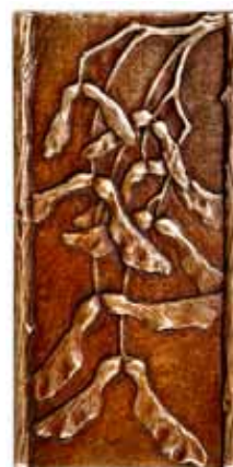
SKU-551 ~ 3x6 Maple Border ~ Bronze/Brown