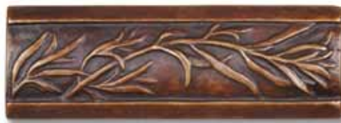
SKU 134 ~ 2x6 Rosemary Border - Bronze/Brown