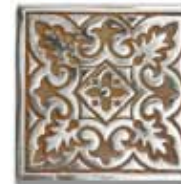
SKU 505 ~ 2.5 Aurora Nickel / Antique Brown