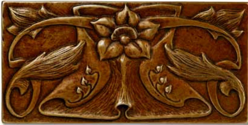
SKU 603 ~ 3x6 Horizontal ~ Bronze / Brown