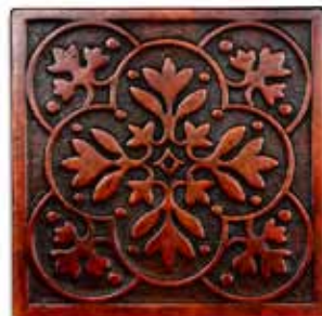
SKU 510 ~ 4x4 Lorenzo Bronze / Statuary