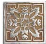
SKU 506 ~ 2.5 Toscana Nickel / Antique Brown