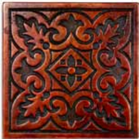
SKU 511 ~ 4x4 Aurora Bronze / Statuary