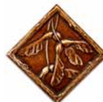
SKU-552 ~ 3x3 Maple Insert - Bronze/Brown