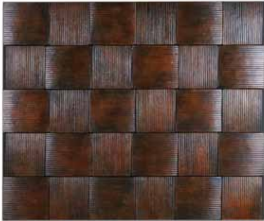
CANEWEAVE DESIGN BOARD IN BRONZE / STATUARY