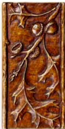
SKU-I18 ~ 3x6 Oak Border - Bronze/Brown