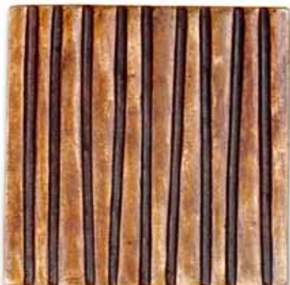
SKU 394 ~ 4x4 Fragment ~ Bronze/Brown