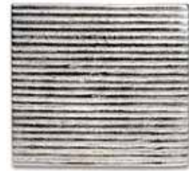
SKU 611 ~ 3 x 2.75 CANEWEAVE / NICKEL NATURAL LUSTER