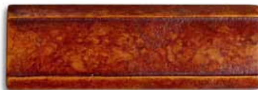
SKU 270 ~ 2x6 Montana Border Bronze / Brown