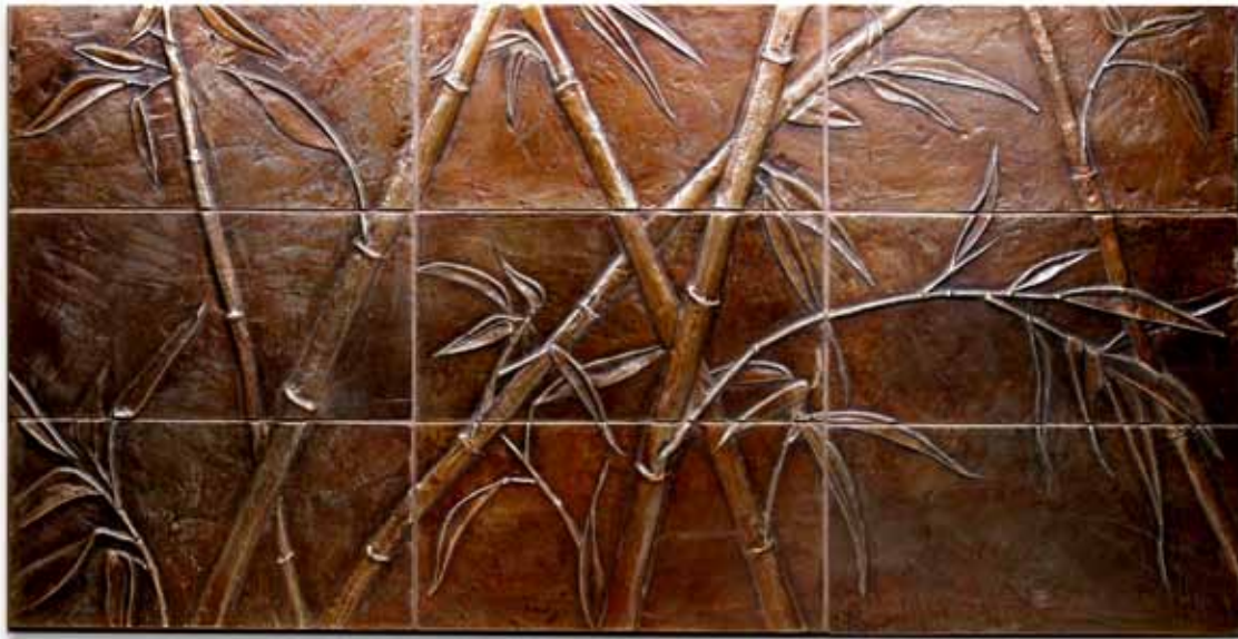
SKU 153 ~ 18 x 36 Bamboo Mural ~ Bronze/Statuary SKU 154 ~ 1