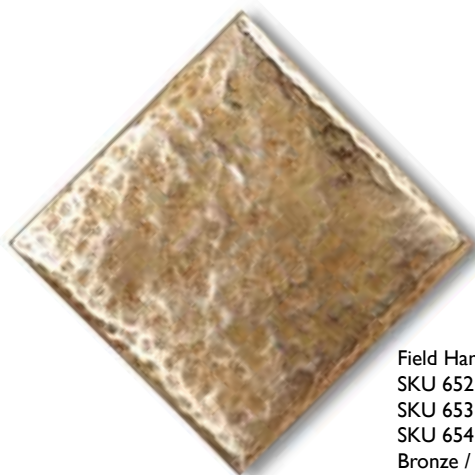
Field Hammered SKU 652 ~ 1 inch SKU 653 ~ 2.5 inches SKU 654 ~ 2 inches Bronze / Natural Luster