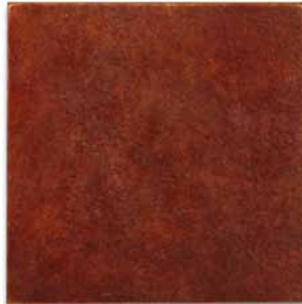
4x4 Bronze Red