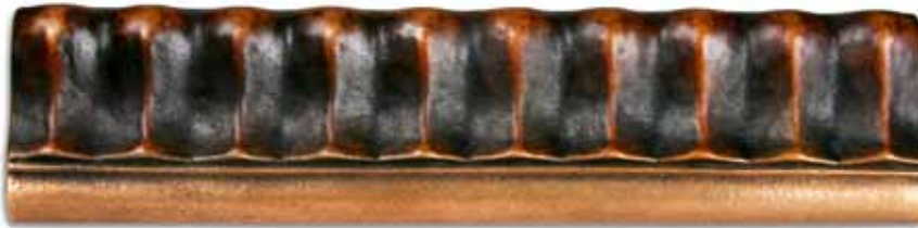
SKU 481 ~ 2.5 x 10 OVERTURE ~ Bronze / Statuary / Natural Luster Fillet