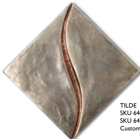
TILDE SKU 644 ~ 1.25 inches SKU 645 ~ 2.5 inches Custom Nickel / Red