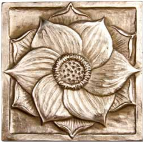
SKU 531 ~ 4 x 4 Lotus ~ Bronze/Natural Luster SKU 532 ~ 3 x 3 Lotus