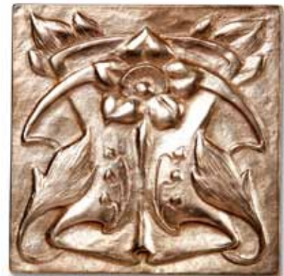
SKU 601 ~ 3x3 Bronze / Natural Luster