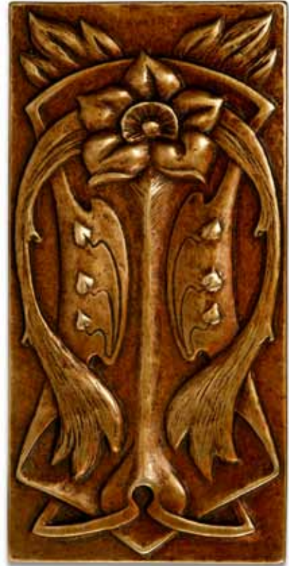
SKU 604 ~ 3x6 Vertical Bronze / Brown