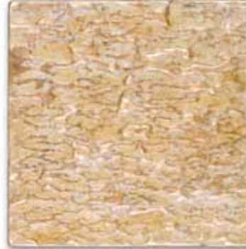
SKU 110 ~ 4x4 Castine Bronze/Yellow Ocher