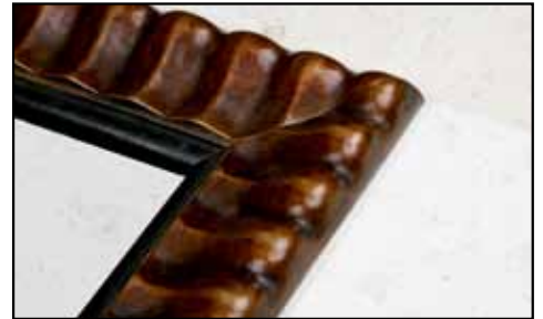
Duo-Tone ~ Bronze / Brown / Black Fillet