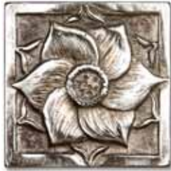
SKU 533 ~ 2x2 Lotus Niickel/Natural