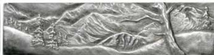
SKU 466 ~ 2-1/2 x 10 Mountain Frieze "B" ~ Nickel / Natural Luster