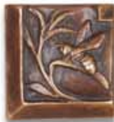
SKU 135 ~ 2x2 Rosemary Corner - Bronze/Brown