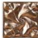
SKU 272 ~ 2x2 Gothic Vineyard Bronze/Natural Luster