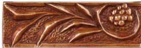
SKU 168 ~ 2 x 6 Gothic Grape ~ Bronze/Red