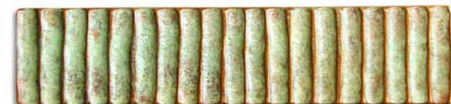
SKU 220 - 2x8 Nevelson Bronze / Verdigris