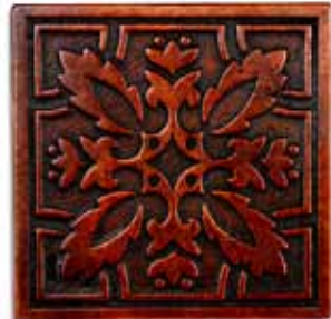
SKU 512 ~ 4x4 Toscana Bronze / Statuary