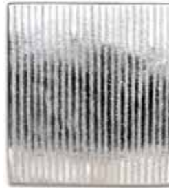
SKU 610 ~ 3 x 3.25 CANEWEAVE / NICKEL NATURAL LUSTER