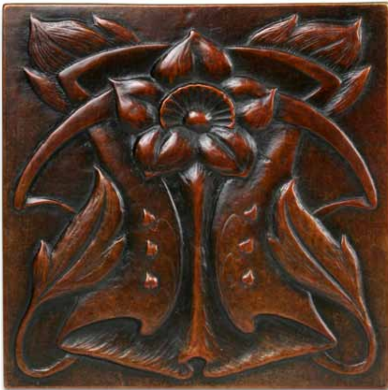
SKU 602 ~ 6x6 ~ Bronze / Statuary