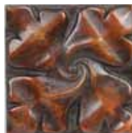
SKU 268 ~ 3x3 Gothic Vineyard Bronze/Statuary