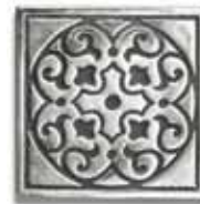
SKU 503 ~ 2.5 Duomo Nickel / Antique Black