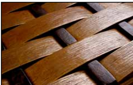
DETAIL BRONZE BROWN WEAVE WITH STATUARY BRICK