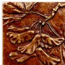
SKU-I03 ~ 4x4 Maple - Bronze/Brown