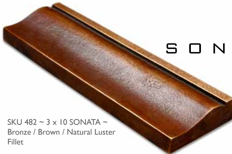
SKU 482 ~ 3 x 10 SONATA ~ Bronze / Brown / Natural Luster Fillet