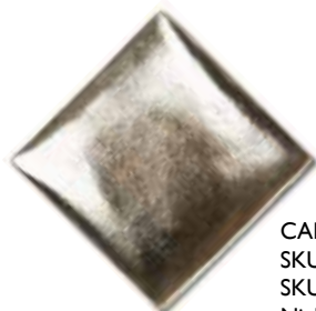
CAIRN Minimal SKU 650 ~ 1.25 inches SKU 651 ~ 2.5 inches Nickel / Natural Luster