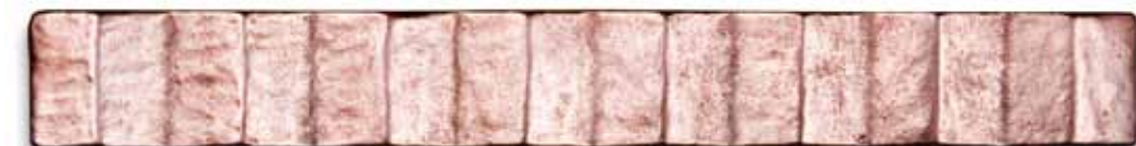
SKU 444 ~ 1-1/4 x 10 Bellows ~ Copper