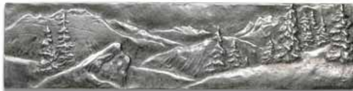
SKU 465 ~ 2-1/2 x 10 Mountain Frieze "A" ~ Nickel / Natural Luster