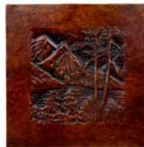
SKU 461 ~ 6 x 6 Mountain Scene SKU 483 ~ 4 x 4 Mountain (no frame) - Bronze / Statuary