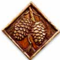
SKU-I08 ~ 3x3 Pine Insert - Bronze/Brown